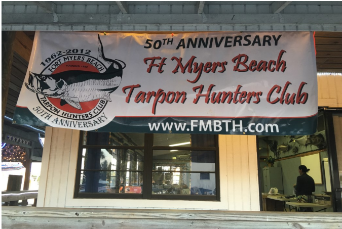
Welcome Tarpon Hunters (It might be time for a new Banner)