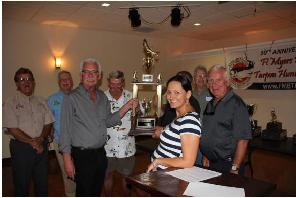
Interclub Trophy Winners