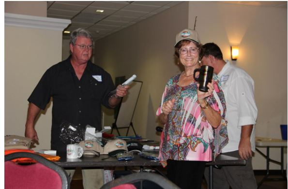
We had plenty of Raffle Prizes and some big winners!